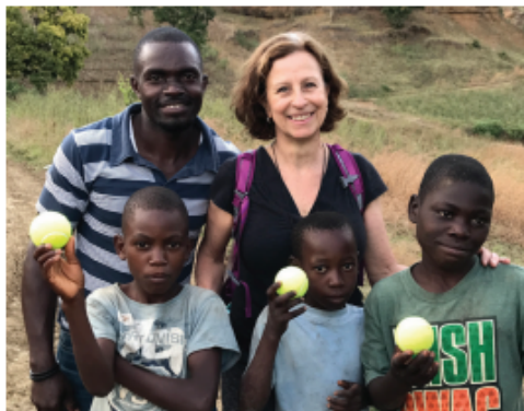
Hiking the countryside and meeting new friends.